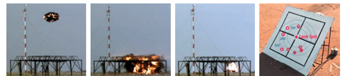
Height of Burst Instantaneous Impact Delayed Impact Accuracy