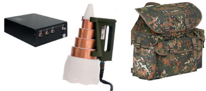
VULCANO Programming Unit (Integration Kit) and portable Fire Command Unit (stand alone)

The flight sequences of the 155mm ammunition type encompass a Ballistic Flight Path (1) involving Initialization and GPS Acquisition, a Glide Path (2) with Mid-Course GPS Navigation and Terminal Guidance (3) with GPS or SAL mode, depending on the configuration.