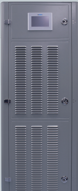
DATA & VIDEO MANAGEMENT UNIT