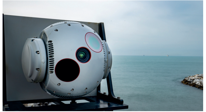
SEARCH HEAD UNIT