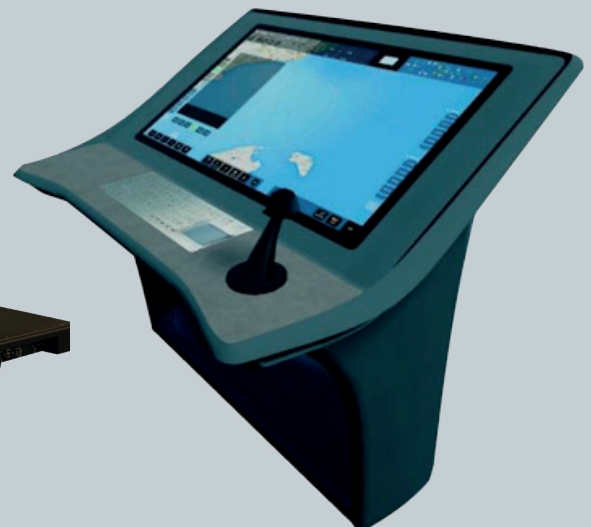
THE MFC (IN PICTURE) OF THE CMS, THAT INTEGRATES AND SHOWS DSS-IRST IMAGES AND COMMANDS.