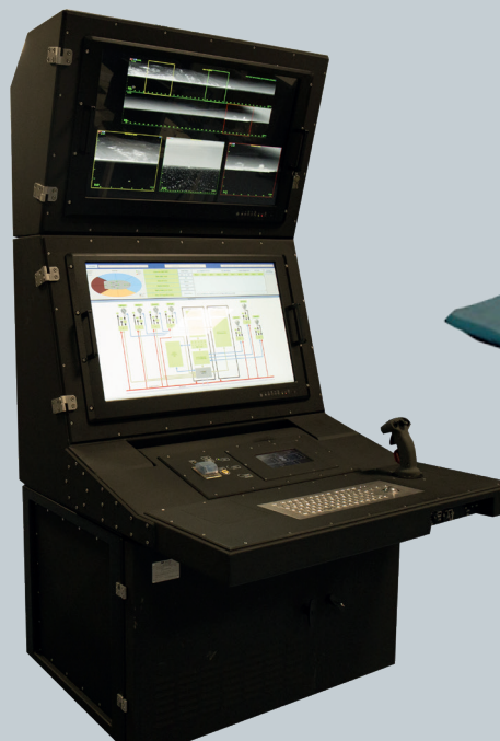
LOCAL CONSOLE UNIT