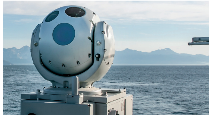
DIRECTIONAL HEAD UNIT (DHU)