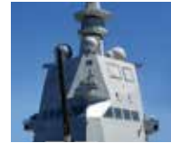
KRONOS DUAL BAND