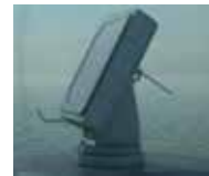
KRONOS GRAND NAVAL