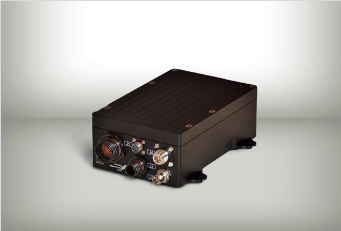
AIS - Automatic Identification System