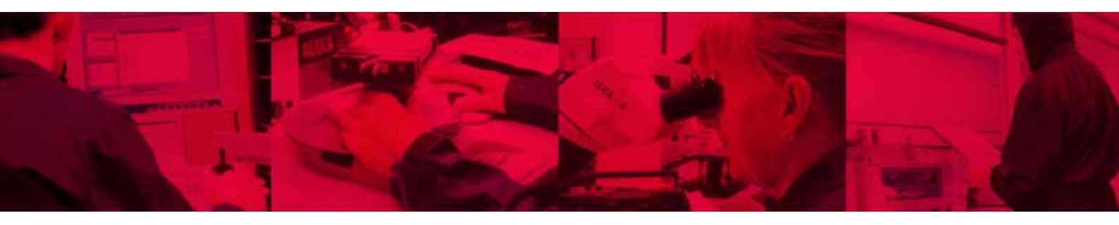
Detector analysis and testing facilities