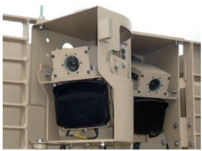
Typical Camera and IR Illuminator installation