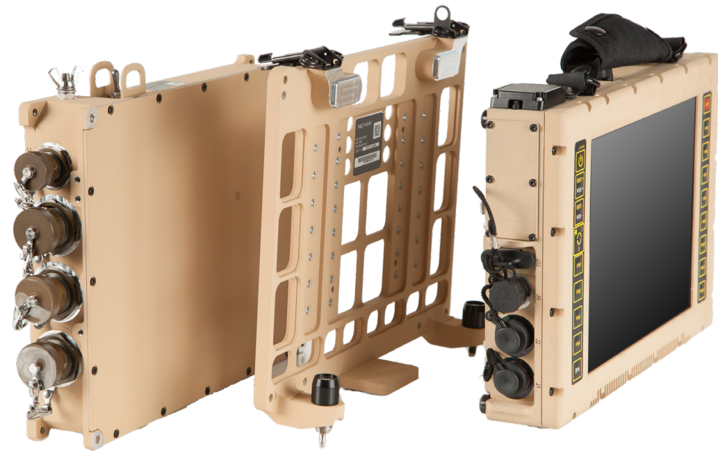
MRT104 II with Tablet Mount and I/O Expansion Dock

The MRT104 II employs multiple embedded security options that provide substantial protection against modern hardware focused cybersecurity threats. Technologies such as a Secure BIOS architecture, per-computer unique BIOS password assignment, digitally signed BIOS updates, factory provisioned TPM, Measured Launch environment, and secure storage of customer pre-placed keys are just a few of the unique security options. Security Deployment tools enable fleet implementation of Secure Boot and Self-Encrypting Drive technologies to protect data integrity and prevent unauthorized boot media.