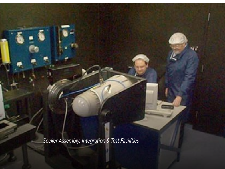
Seeker Assembly, Integration & Test Facilities

More recently the advances in EO seeker technologies within Leonardo have provided the opportunity to develop dual and multi-mode sensing capabilities within a single missile seeker.