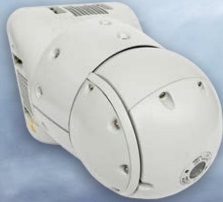
Loitering Munition Dual Mode Seeker