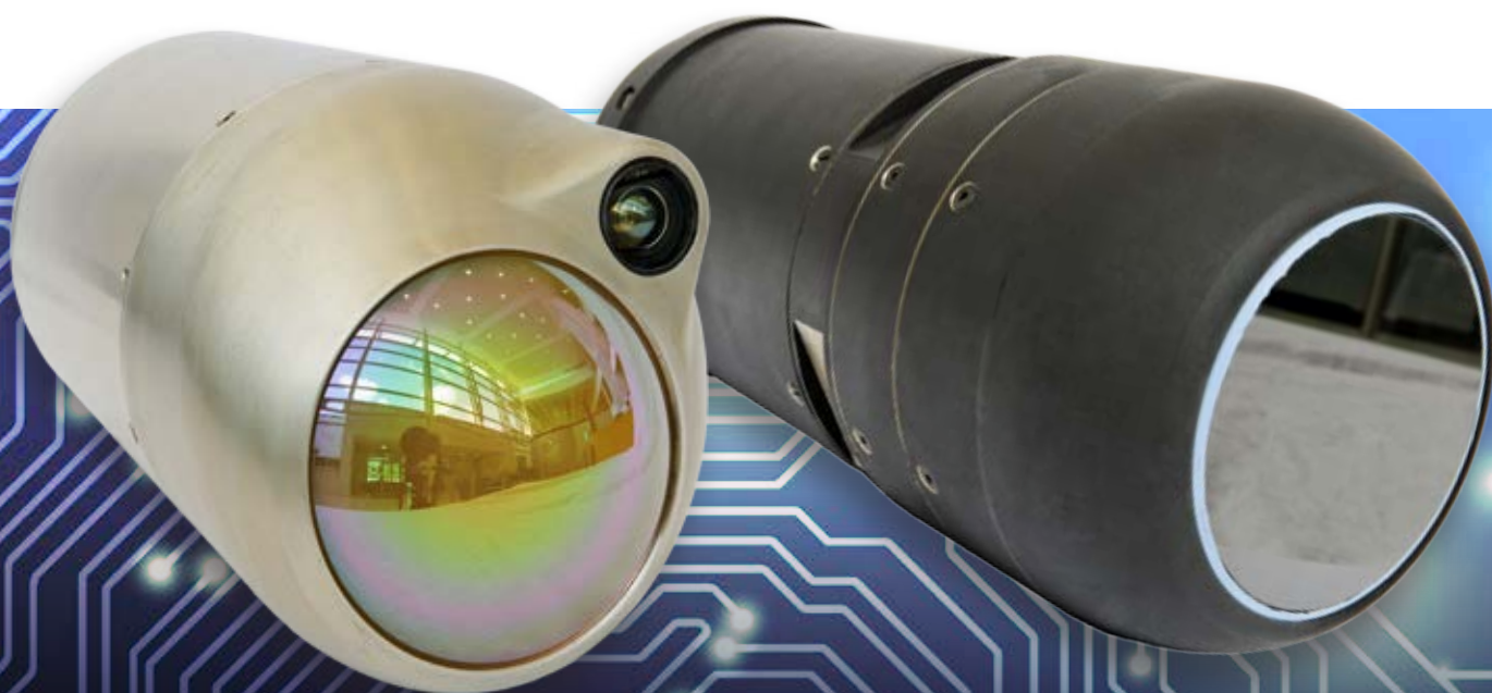
DUAL MODE I2R/SAL SEEKER DEMONSTRATOR

Leonardo recognises that in order to develop mutually beneficial business opportunities in export markets, technology transfer can be an important mechanism. As a company we are open to discussions on this type of collaboration provided that it is structured within a viable overall business framework that offers realisable benefit to our company. Export approvals for collaborations are administered through the Export Policy and Assurance (EPA) department within the UK Ministry of Defence (MoD).