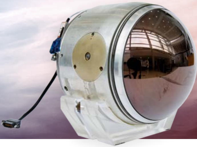
Javelin I2R Seeker

The commencement of development for a Loitering Munition led to the requirement for a dual mode EO seeker with I2R and low light TV sensor performance. Leonardo successfully completed the seeker development within record timescales and achieved the first UK application of uncooled LWIR technology in a missile system.