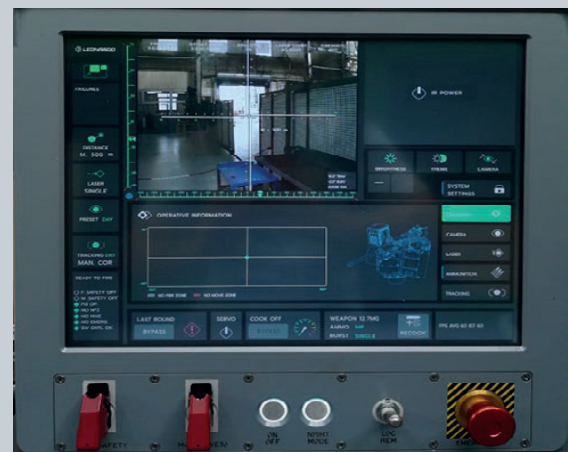
Local Control Panel

(2): Valid for cooled sensor, uncooled one is available too.